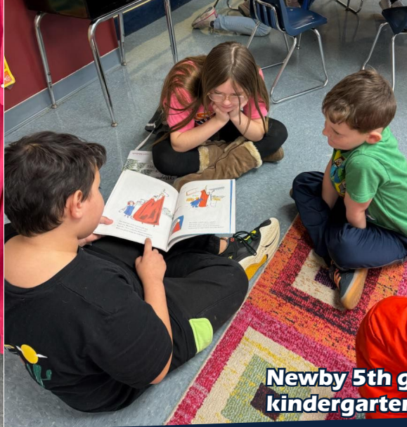
Newby 5th graders read with their kindergarten buddies before the break